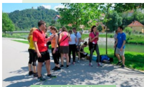
Field work: 2 km walking test

Besides listening to the lectures and the intensive work in workshops, students socialized and cooperated with the elderly by learning Nordic walking, they tested themselves together with the elderly in the 2-km walking test, researched how safe for the elderly are some public institutions in Celje, and prepared short films about people's opinions about aging. The students also discussed the different entrepreneurship ideas in the Celje Business Incubator. We also visited the General Hospital in Celje and Franja Partisan Hospital. The important part of the summer school was also the sightseeing in Slovenia (visits of towns Celje, Ljubljana, Piran) and also various social and sports activities.