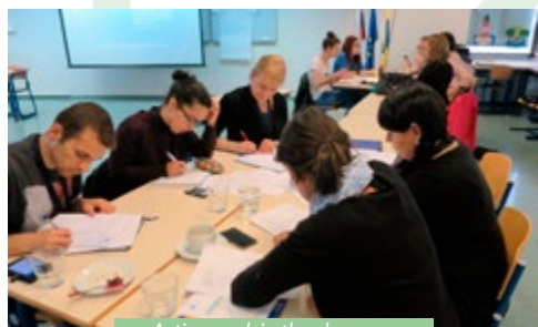
Active work in the classroom

From 23 th May until 3 rd June, 2016, we organized in fruitful cooperation with all of the project partners the 2 nd HLAW Summer School. The College of Nursing in Celje hosted 30 students and 17 teachers from Finland, Portugal, Poland and Slovenia.