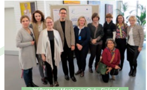
2 nd Partners Meeting in Oulu, Finland