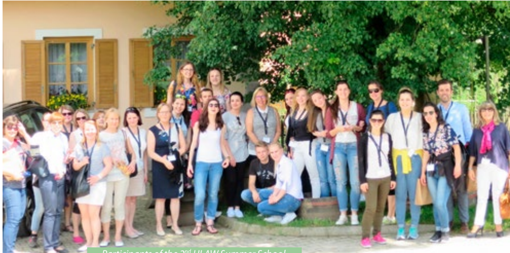
Participants of the 2 nd HLAW Summer School.