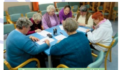
Research work in the home for the elderly

HLAW is a complex project that also involves research activities. In the first year of the research activities, we made the overview of literature from the field of health literacy and physical activity of the elderly in respective countries. The abstracts of the main findings from the 1st International Summer School were presented at the 1st Multiplier Event in October 2015 in Oulu in Finland.